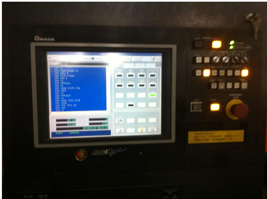
TABLE OF CNC